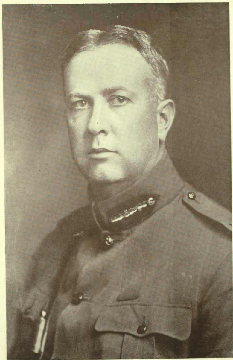
LIEUT.-GENERAL SIR ARTHUR CURRIE Commander of the Canadian Corps